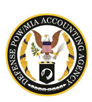
Figure 52-11. Defense Prisoner of War/Missing in Action Accounting Agency insignia.

Located in Tampa, Florida, USSOCOM is the four-star combatant command headquarters for SOF from all services (Figure 52-12).