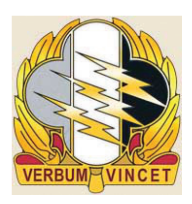
Figure 52-5. 4th and 8th Military Information Support Group insignia.

The brigade provides ARSOF's only Role 2 medical capability. Forward resuscitative surgical teams can augment the Role 1 capability