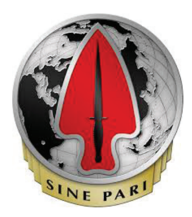
Figure 52-1 . US Army Special Operations Command insignia.

USASOC (Figure 52-1) is a three-star command at Fort Bragg, North Carolina, that generates and sustains Army SOF to conduct worldwide missions across the range of military operations in support of geographic combatant commanders, US ambassadors, and other agencies as directed. The senior command PA serves as the direct liaison to the Human Resources Command 65D (the PA area of concentration) manager for all of ARSOF. They review, select, and coordinate assignments. The following are USASOC's subordinate commands.