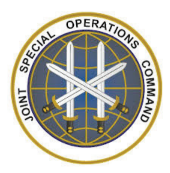
Figure 52-13. Joint Special Operations Command insignia.

The Joint Special Operations Command (JSOC) (Figure 52-13) is a subordinate unified command (established to assume a specific role or mission of a parent command) of USSOCOM. The Joint Medical Augmentation Unit (JMAU) provides highly mobile, far-forward,