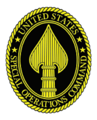
Figure 52-12 . Special Operations Command insignia.