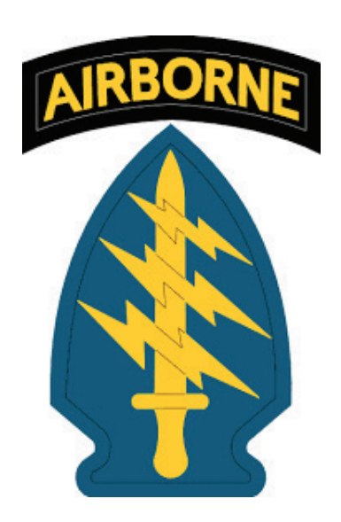
Figure 52-3. Special Forces Group insignia.

95th Civil Affairs Brigade (Figure 52-4) soldiers enable military commanders and US ambassadors to improve relationships with