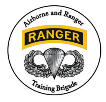
Figure 52-10. Ranger Training Brigade insignia.