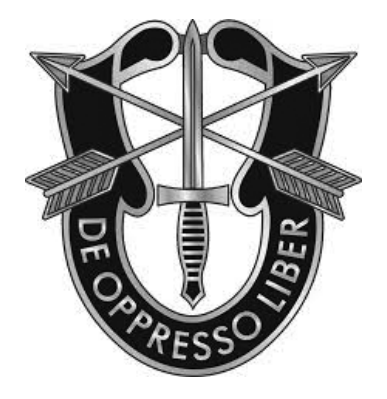
Figure 52-2 . 1st Special Forces Command insignia.